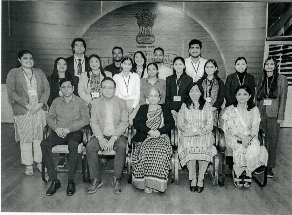
The Hon'ble Chairperson and other Senior officials with the interns of the Winter Internship Programme, 2024