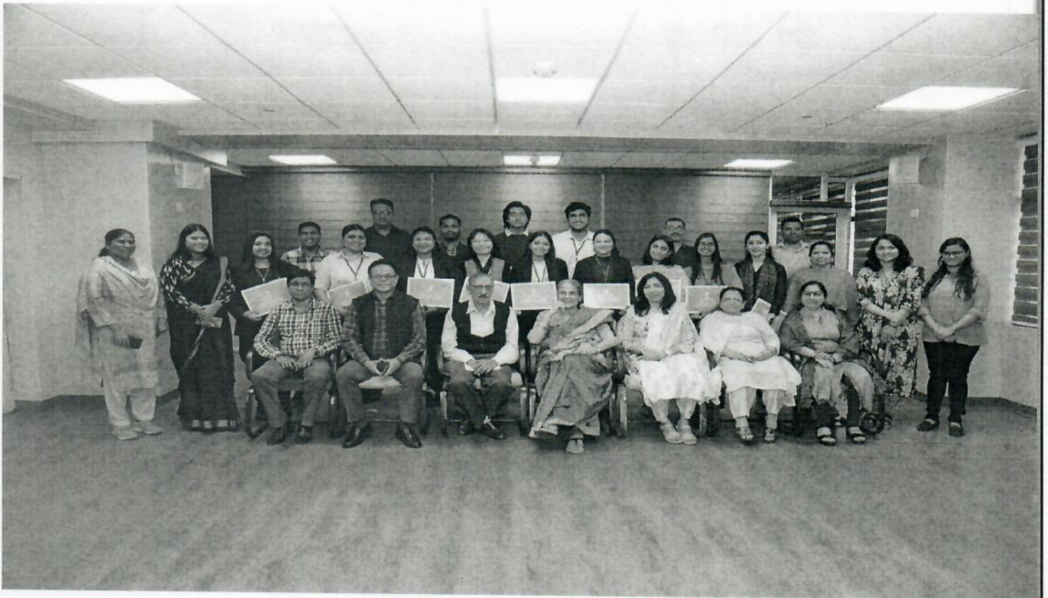
A glimpse of the Valedictory Function held on 12.03.2024